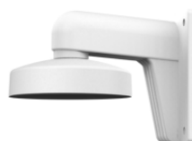
Wall mount SC-1272ZJ-110