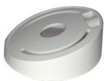
Inclined ceiling mount SC-1259ZJ